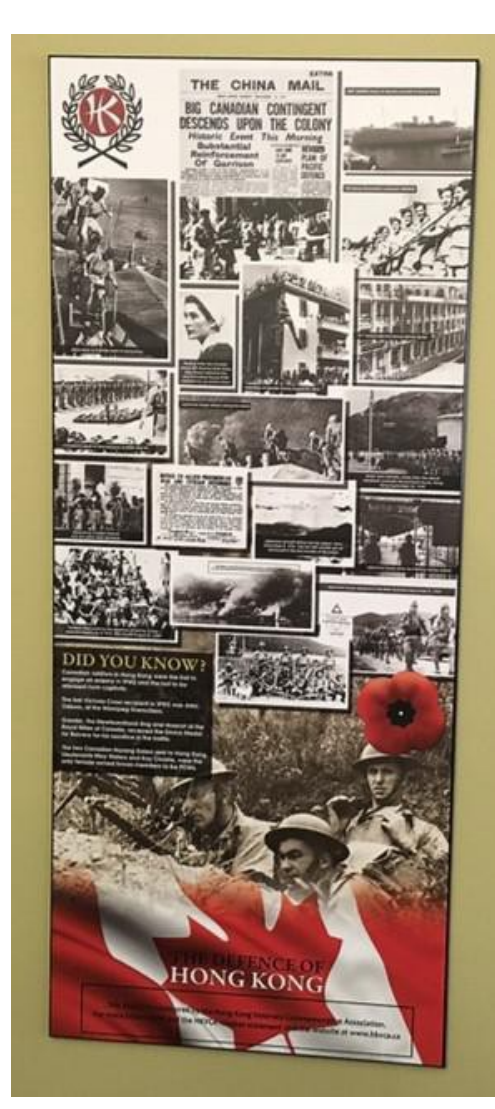
Battle of Hong Kong Plaque Parkwood Institute London, ON