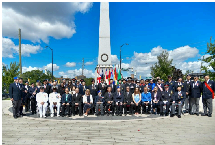
Ceremony attendees. (Used with permission)

The ceremony was very powerful and respectful. I met a man who was there to remember the battle and to say, "Thank you," for his father. His father had lived in Hong Kong, and witnessed the battle as a youth. He did not speak English, and did not understand the significance of the maple leaf. When he emigrated to Canada, he recognized the maple leaf. This man attended a ceremony every year and his son, like many, kept the tradition to say thank you for his father. Like this gentleman, we were all there to say thank you to those who served, to those who stayed and to those who came home.