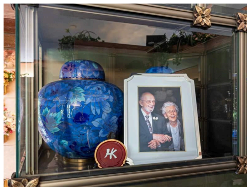
Gravestone Markers - COLUMBARIUM OPTION

We thank all of you who have donated money towards the purchase of the HK gravestone markers on the graves of our veterans who no longer have family.