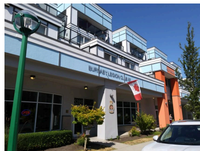
Exterior view of the Branch 83 building.

contains various memorabilia on its walls, and the Commemorative Plaque was placed near the main entrance of the hall, for all to see.